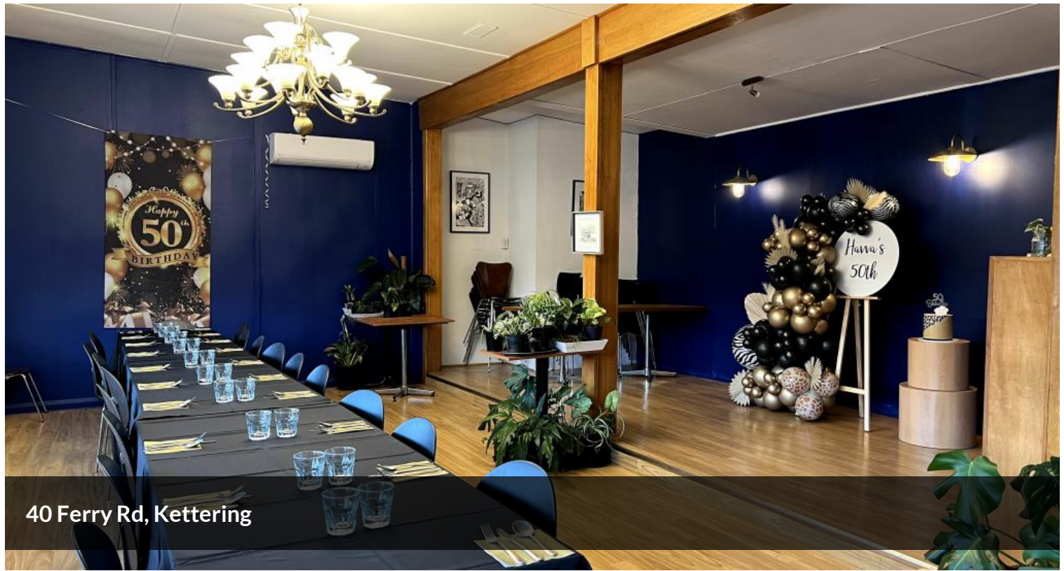
40 Ferry Rd, Kettering